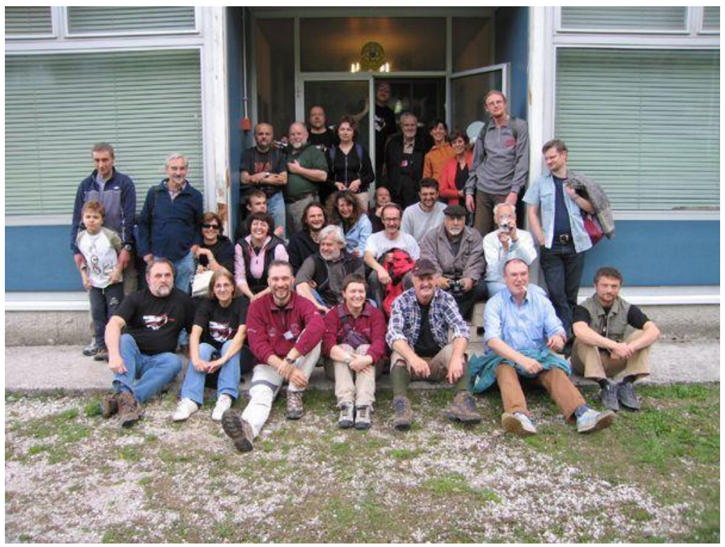
Photo 2 The participants of the Symposium in front of building of the Centro Ricerche Carsiche "C. Seppenhofer" in the Taipana village