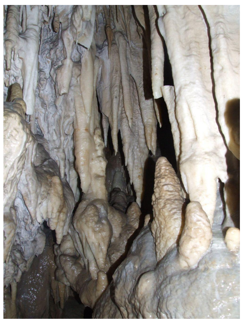
Photo 5 The walls of Grotta di Villanova in many places are covered by picturesque calcite speleothems